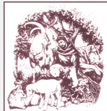
St. Francis' Day: October 4th

Music, Prayers, Scripture, Blessings & Treats! Special Remembrances for Beloved Pets Who Have Died (please bring a picture for a Memory Board)